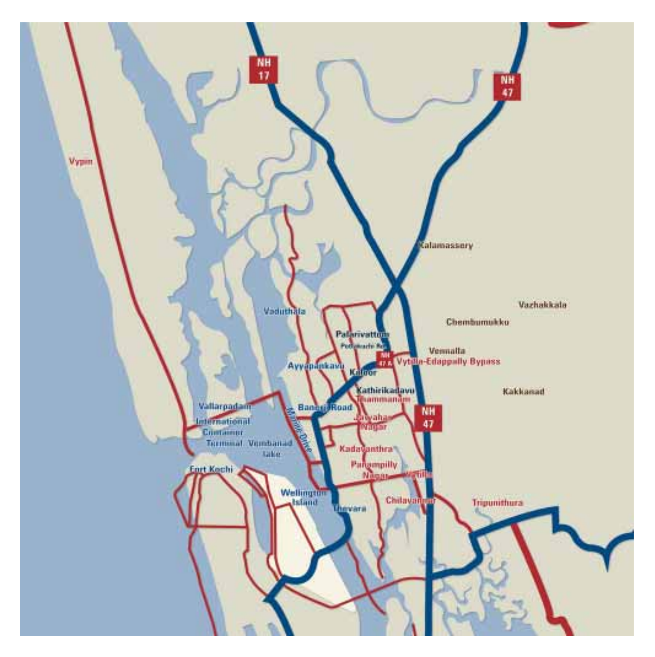
Note: The map is not to scale and is for illustration purpose only.

We have classified the real estate space in Kochi into five distinct zones: South-West Kochi, South-East Kochi, East Kochi, North Kochi and North-East Kochi, on the basis of location and real estate activity.