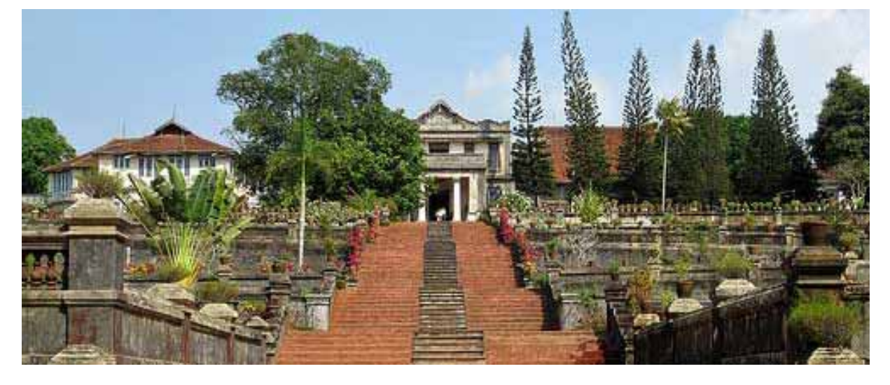
Hill Palace Museum, Tripunithura

Thus, after analysing the macro-trends in Kochi Realty, we delved deeper and analysed the micro-trends.