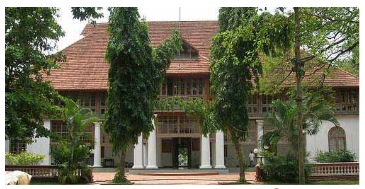
Bolgatty Palace, Kochi

**Indicative mid market segment